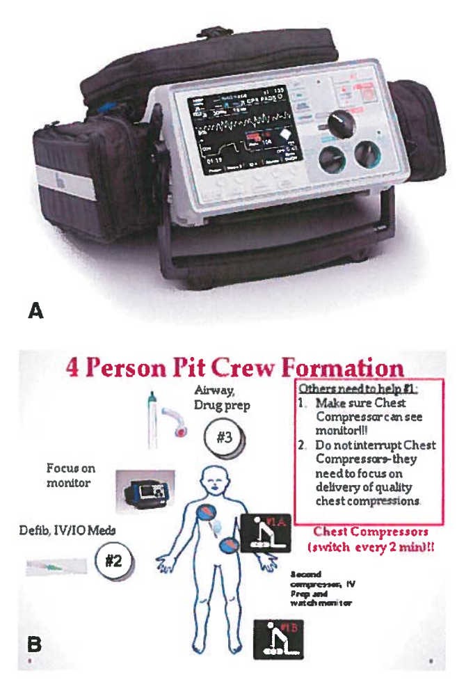
Figure E1. A , E Series Defibrillator Display with Real-Time Audiovisual Feedback Enabled (ZOLL Corporation, Chelmsford MA). B , Coordinated multiprovider resuscitation schematic.